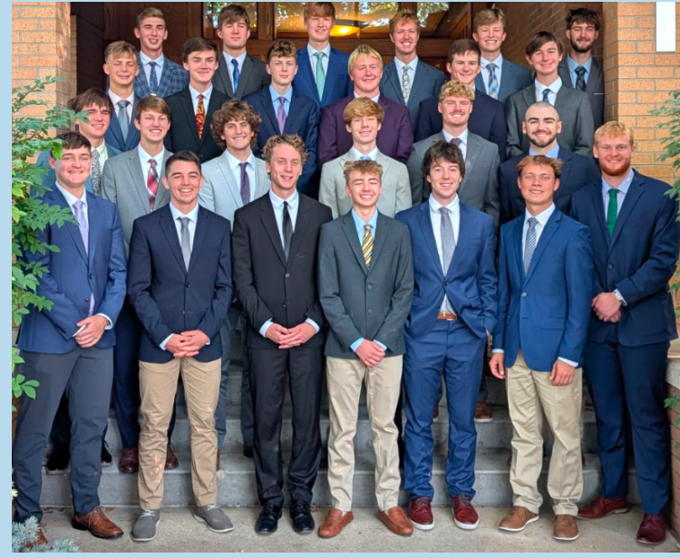
The 23 new members that were initiated this past fall