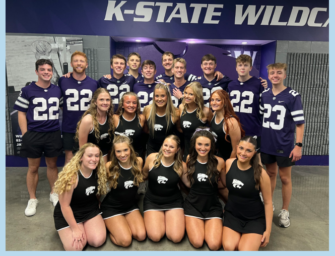
Homecoming: FH x GPHi x AOE: We had a very successful homecoming with our partners Gamma Phi Beta and Alpha Omega Epsilon. Fun was had while building our 2nd place float, competing in Pant the Chant, and placing 4th in Wildcat Request Live.