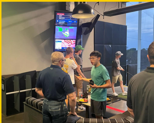
FarmHouse members enjoy a recent event at TopGolf