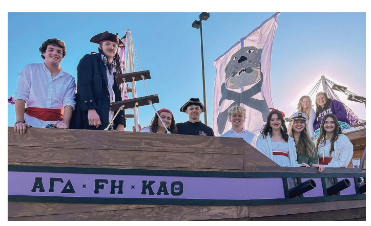
During homecoming FarmHouse won best float and finished second overall!

Fraternally, Trent Dodge (Kansas State 20)