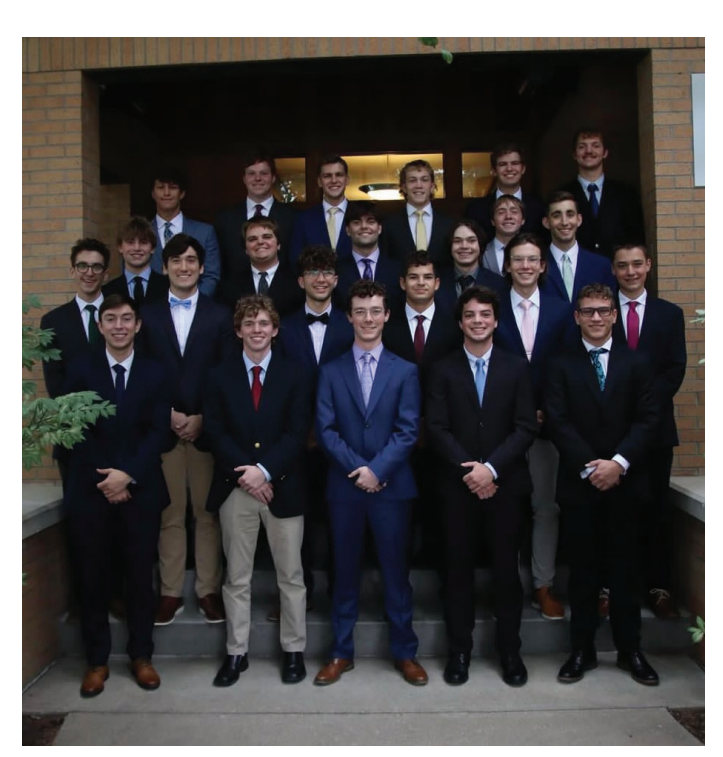
This fall 24 new members were welcomed into the Fraternity. The future of FarmHouse is in good hands! Look inside to see the full list of new members.