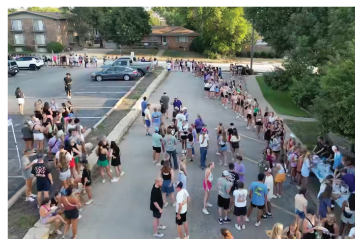
The annual ice cream social to celebrate the first day of classes was a big hit for students and the community.