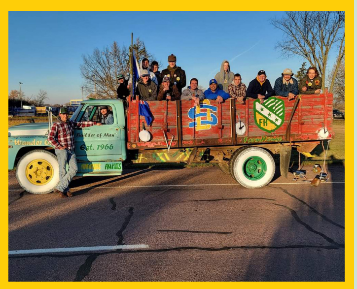
The Men of FarmHouse embodied the Hobo Spirit with their "Hobomobile" that was driven in the parade.