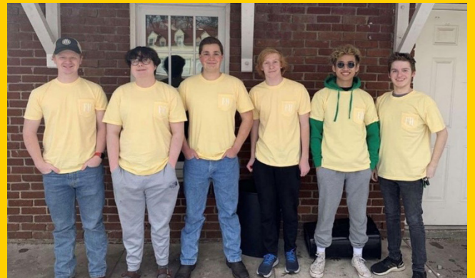
Spring 2022 new members.