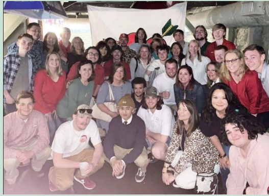
Top left: Fall 2021 new members at Western themed party Top middle: 2021-2022 Executive team Top right: FH men at Alpha Chi Omega Pizza Pie event