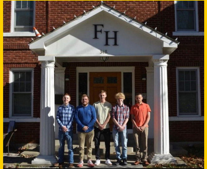
Fall 2021 new members.