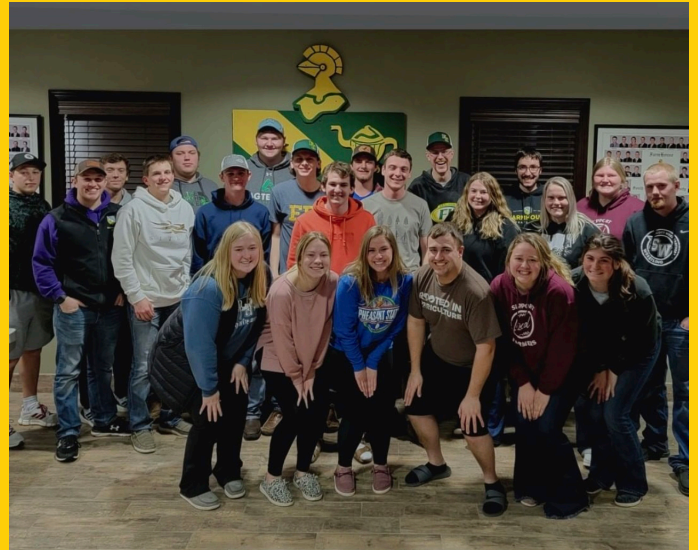
Chapter members joined Sigma Alpha club for a night filled with games at the chapter house.

The 'S' in FarmHouse stands for Service, and it has not been overlooked by the South Dakota State FarmHouse Chapter. Our members have worked diligently to accomplish and exceed goals in Community Service and Philanthropy. Last spring, the chapter members had a record breaking Totally Baldacious event that was broadcasted live on Facebook. In total they raised over $14,000 for Ella's Warriors and the Leukemia & Lymphoma Society. Then in the fall, they set another record out on Lake Campbell, taking out docks and boat lifts for 70 homeowners and businesses. The generous donations given by the people of Lake Campbell total over $9,000, and set the chapter up for another record breaking Philanthropy event this spring. Our members have gone above and beyond with other Community Service as well. Last fall they racked up over 1,000 Community Service hours, averaging 34 hours per member. All of this hard work and promise of service was recognized by FarmHouse International as the chapter received the Excellence in Philanthropy, Philanthropy of the Year, and Community Service Achievement awards at FarmHouse Leadership Institute in January 2022. As Alumni, we can be proud of the commitment to service and character shown by our undergraduate members.