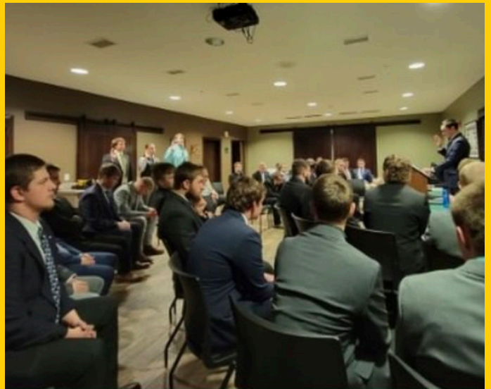
Star and Shield Ceremony was held last month. Members learned what the star and shield symbolize during the event.