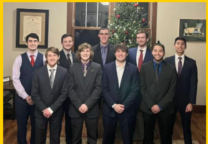
Fall 2021 New Chapter Executive Team