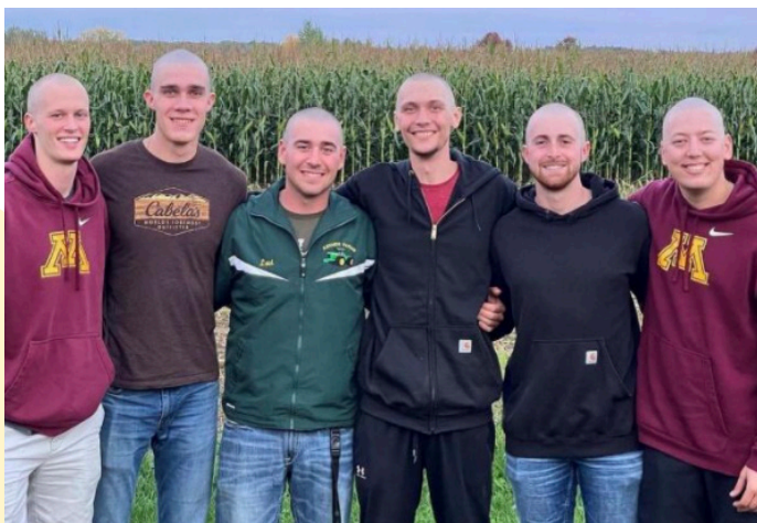
Brothers shave their heads in support of breast cancer awareness.