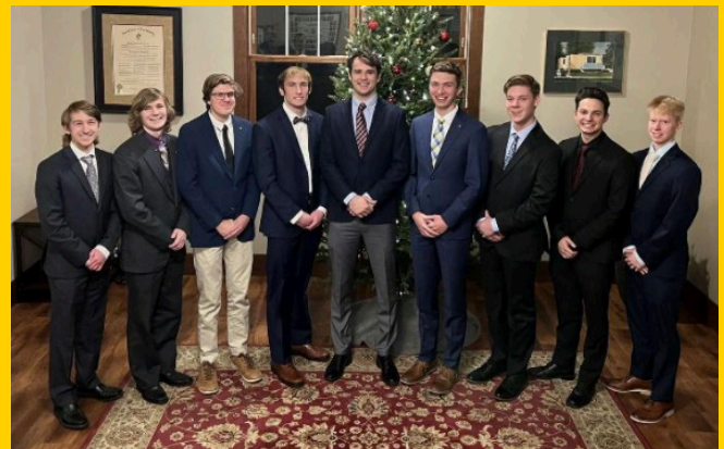
Fall 2021 New Member Class

The University of Minnesota FarmHouse Association teamed up with the Ag Ed Alumni to host two tailgates before U of M home football games. The events were well attended by current students and alumni.